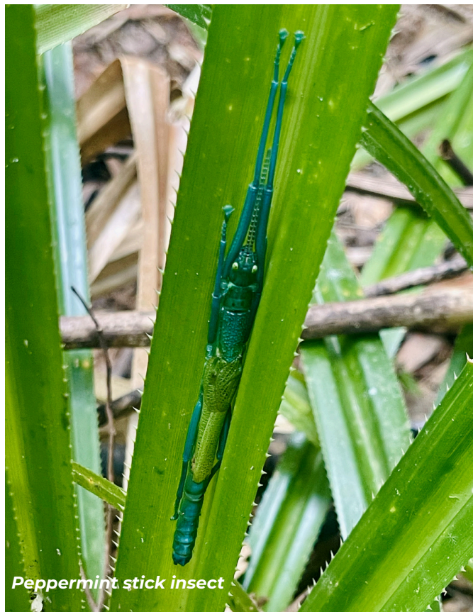
Peppermint stick insect